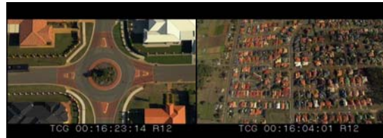
C/U and wide shots from 1500ft over Brisbane

The Toyota IMV project for Dentsu Japan, a two-country aerial shoot, (Australia and New Zealand) shot a variety of locations chosen to mimic the Arabian desert, African savannah, tropics of Asia, coastal, mountains and Siberia as well as urban and suburban aerial scenes.